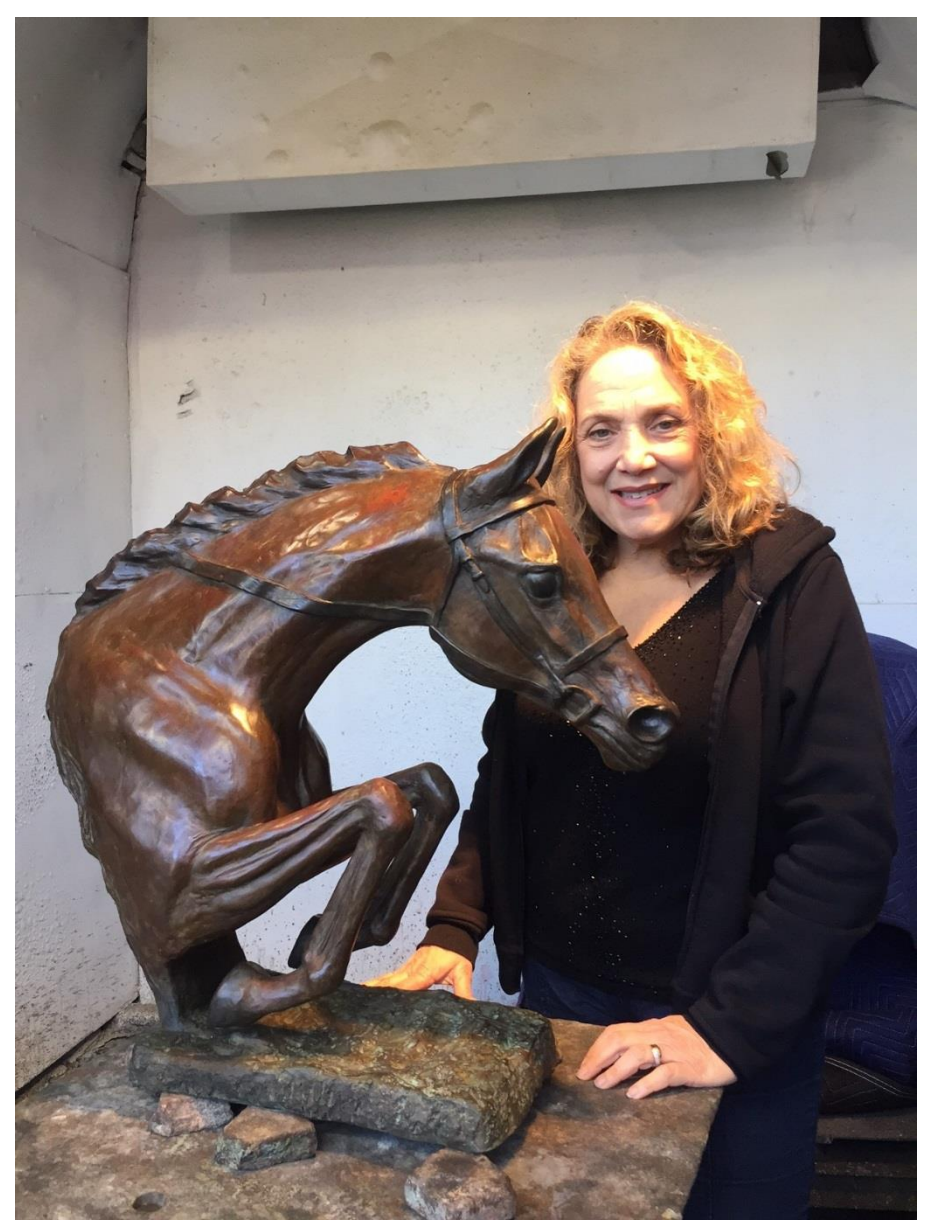
Artist with Soaring Spirit- this horse head represents Australian horses

Comprising three main areas; the renowned Queensland State Rose Garden, children's playground and barbecue area, and the sports ovals including croquet lawns and cricket pitches, there is something for everyone at Newtown Park. There are also a number of linking pathways throughout the park with murals, plaques and rest areas dotted throughout for the enjoyment of park users.