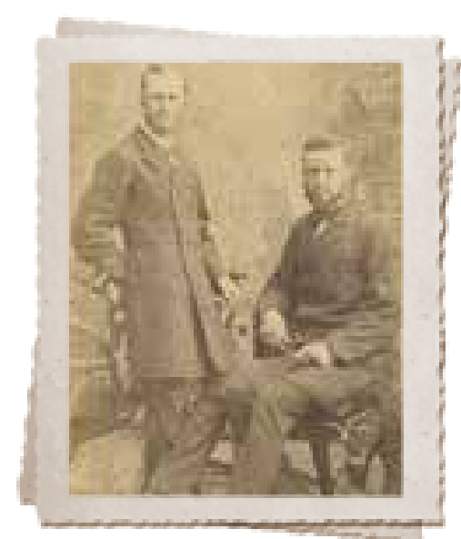
FW Troy & BC Black

After this decision, Cheek went to southern Tasmania, preaching in the New Ground area, baptising some 40 people in 1879. It was here that Cheek also launched his magazine, 'Truth in Love', which would continue on through his ministry in Queensland. 8 Cheek also pioneered churches in parts of rural Victoria during this period (in the Elphinstone, Taradale and Drummond region), where he met with good success. However, to be an evangelist in the 1870s and 1880s was no easy task. Upon returning to Tasmania, Cheek went to Bream Creek on the Tasman Peninsula and – amid great opposition – planted a church there in February 1879 with an initial membership of 50 people. Cheek left Bream Creek in April 1879, only to return in September of that year, where the hostility he had endured previously manifested itself in a savage assault. Court records show that Cheek was flogged, beaten and pelted with eggs, as well as being threatened that if he did not leave Bream Creek by the next day, he would be "tied to a tree and his flesh separated from his bones." The offenders were later tried, and found guilty, but Cheek's attorney made it clear that his client was not seeking severe damages. Cheek's manner during and after the trial must have struck a chord – the persecution stopped and, in 1881, Cheek baptised one of his assailants, Albert Mundy.<sup>11</sup>