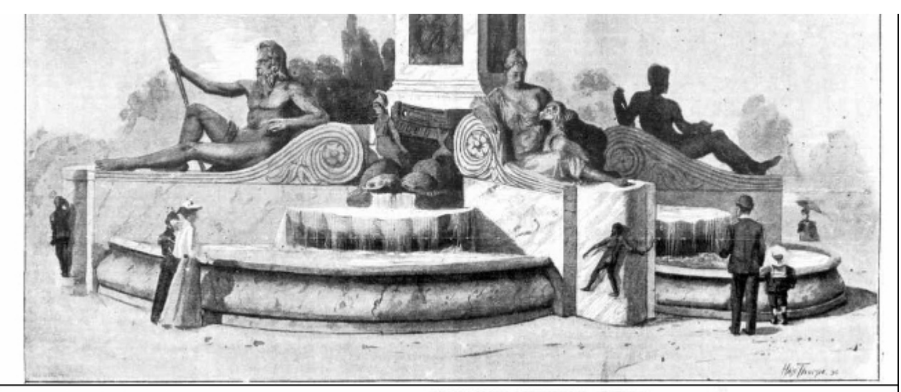
GOVERNOR PHILLIP'S STATUE. Complete design with pedestal fountains and allegorical representations to be creeted in the Inner Domain, Sydney.