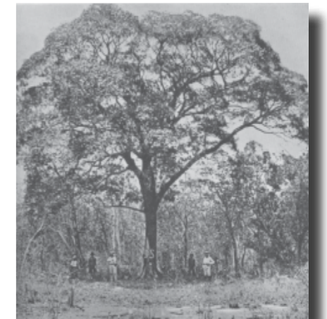
Aboriginal and non-Aboriginal people beneath Stuart's Tree carved with large 2 ft (61 cm) initials. Photo Paul Foelsche 1885.

In 1971 the Reserves Board of the NT placed a memorial cairn where the tree once stood, which is still in place today.