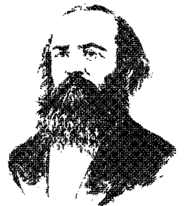
John McDouall Stuart 1815 - 1866

Stuart knew of their success and death before he set out in October 1861 for his last successful attempt.