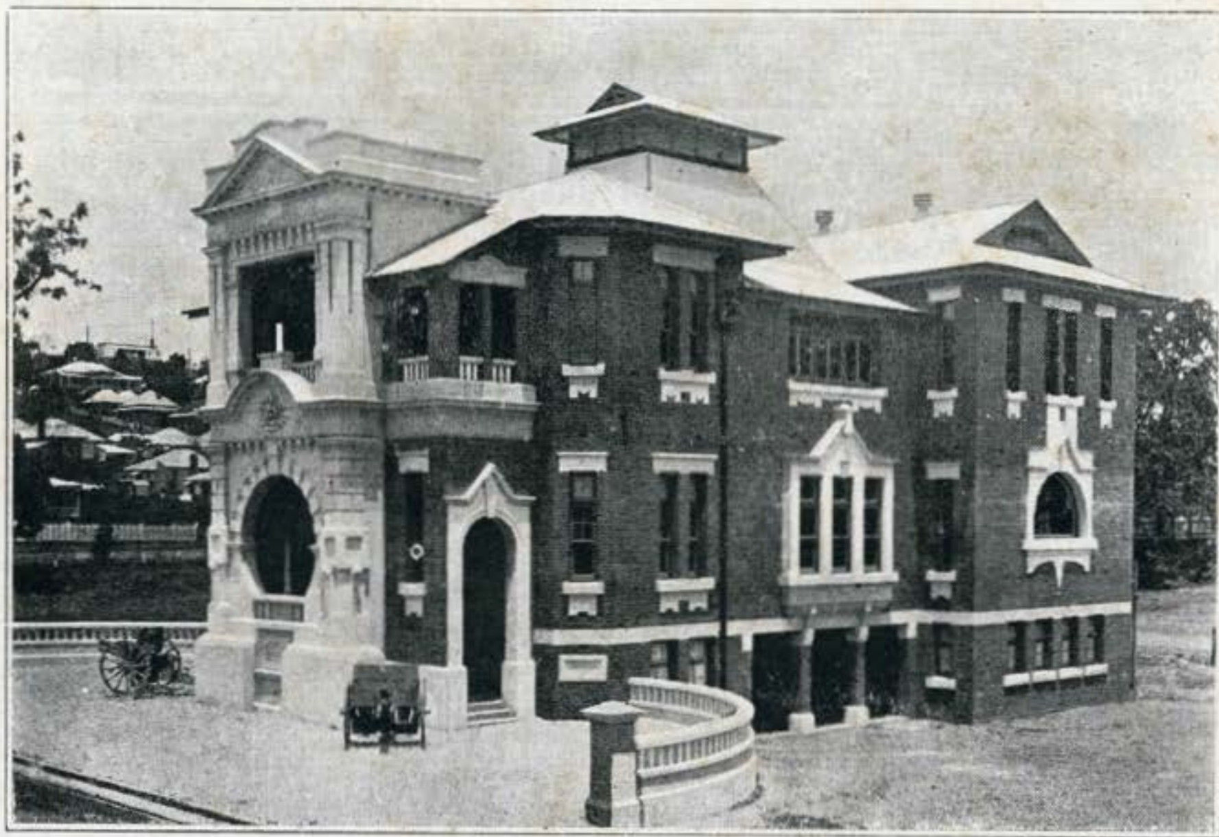
Side View of Hall.