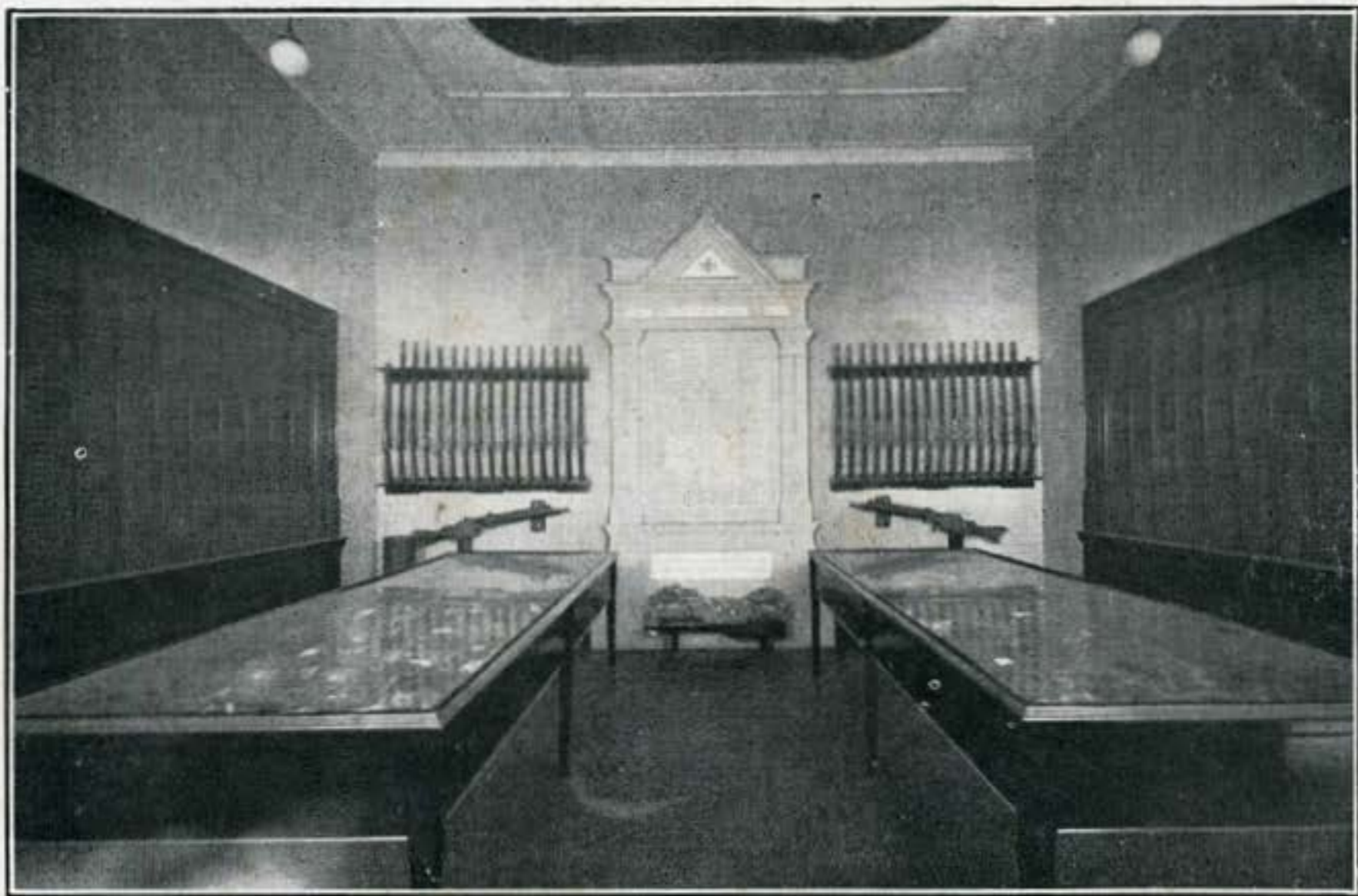
The Vestibule, showing In Memoriam Monument, Honor Boards and Trophies of the War