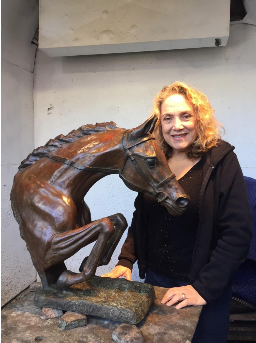
Artist with Soaring Spirit- this horse head represents Australian horses

Comprising three main areas; the renowned Queensland State Rose Garden, children's playground and barbecue area, and the sports ovals including croquet lawns and cricket pitches, there is something for everyone at Newtown Park. There are also a number of linking pathways throughout the park with murals, plaques and rest areas dotted throughout for the enjoyment of park users.