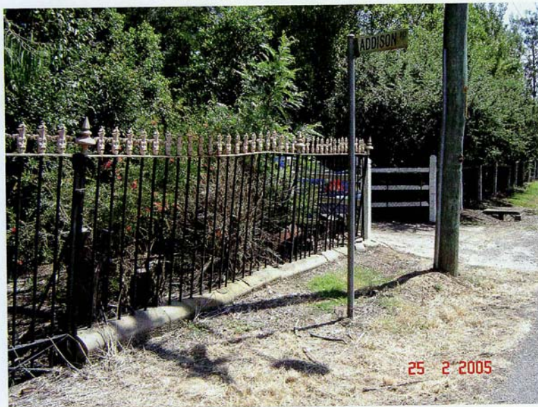
'SHENSTONE' PROPERTY 20 WESTBOURNE ROAD BOLWARRA FENCE REQUIRING RELOCATION