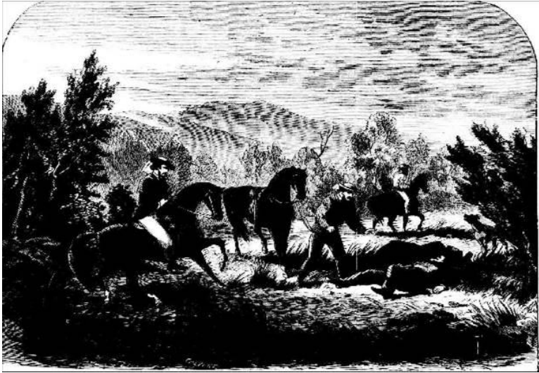
The finding of the bodies of Carroll's party of special police