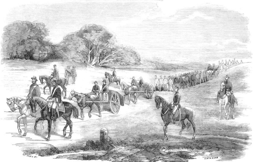
Funeral procession of the Special Police