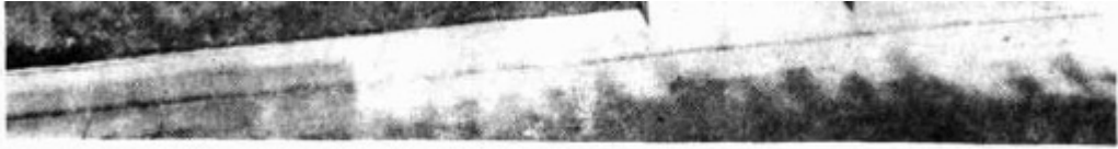
BERGER'S "GARDEN OF HONOR." The Unveiling Ceremony.