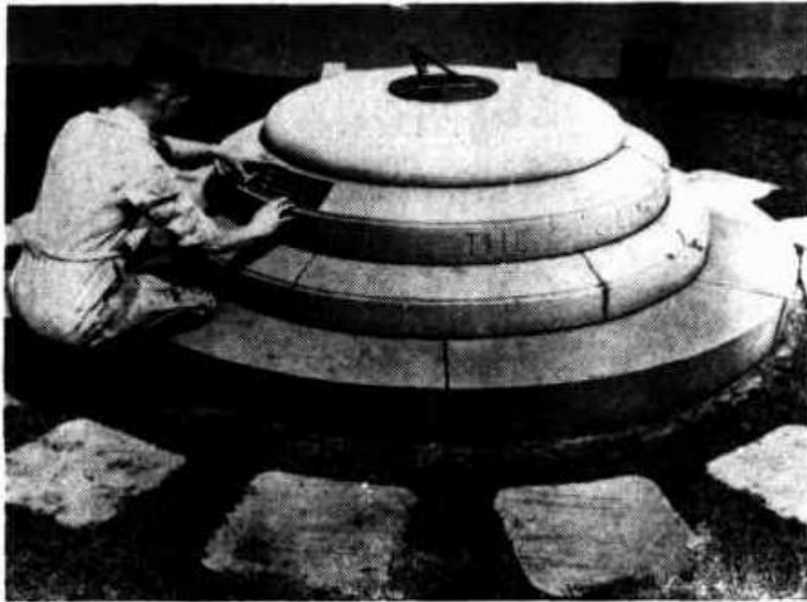
Sundial to commemorate Service Men and Women fighting for the country and the employees of Berger & Sons (Aust.) Pty. Ltd.