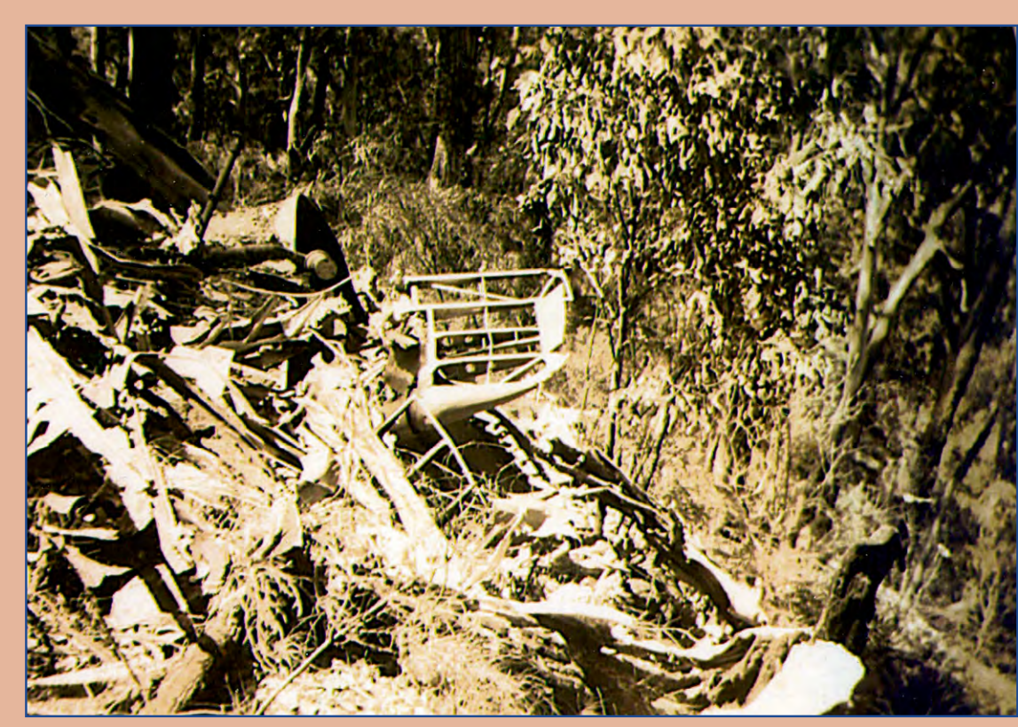
Plane Crash site 1949.