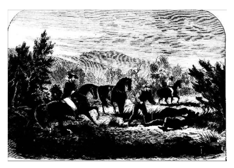
The finding of the bodies of Carroll's party of special police